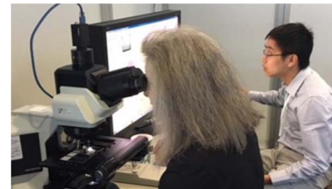
Data Collection At ASCP 2018